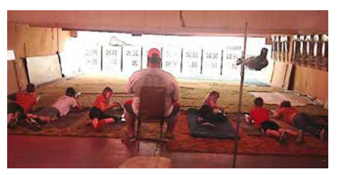
2016 Fair Shoot Group Fair Shoot Air Rifle and .22 Rifle