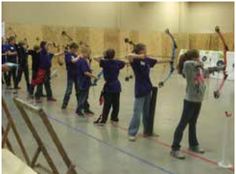
Shooting at Washington Co.