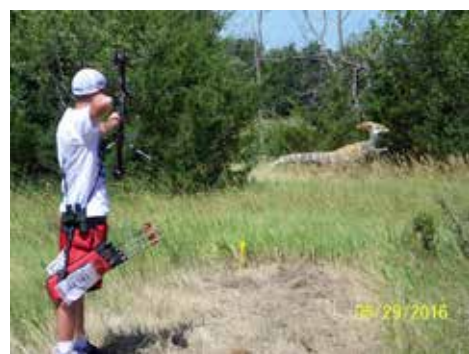
FITA Round Field Round 3-D Animal Round