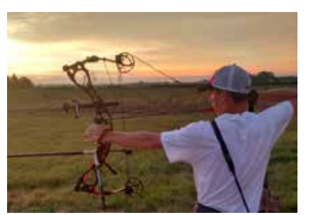
Early AM practice for Nationals